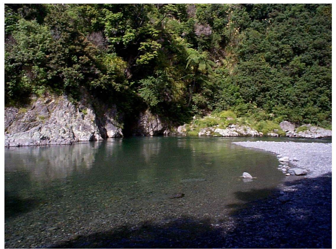
Waingawa River at Kaituna

During the bathing season, weekly water test results were collated by the Greater Wellington Regional Council and displayed at <u>www.gw.govt.nz/on-the-beaches</u>. Water test results from the Wairarapa monitoring sites were published weekly by the "Wairarapa Times-Age" newspaper.