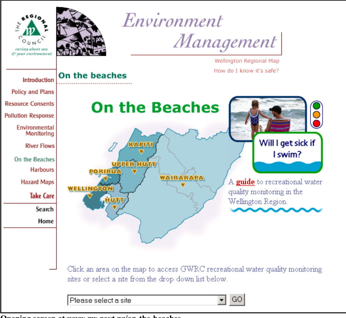
Opening screen at www.gw.govt.nz/on-the-beaches