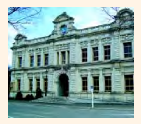
Local character – Oamaru has many unique historical buildings created from the local creamy white 'Oamaru Stone'.

According to David Thorns , "at the local level the preservation of difference has become valued, sometimes as a commodity to sell, through the rediscovery of heritage sites and conservation and the recreation of the past".