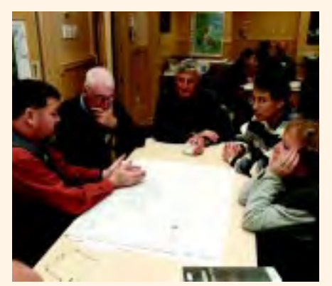
User participation – Planning workshops provide an opportunity for users to provide input into decision-making processes.

Evidence points to the need for good management of the user participation process if it is to be effective. Otherwise the result may be gridlock, or poor outcomes reflecting narrow or vested interests at the expense of the wider public interest. A clear brief for participants, the selection of representative participants, background research and analysis, and experienced facilitation are all shown to be helpful in achieving effective user participation.