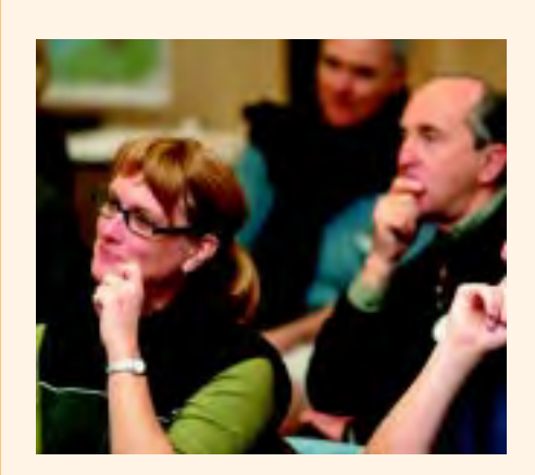
User participation – Public consultation is one form of user participation.