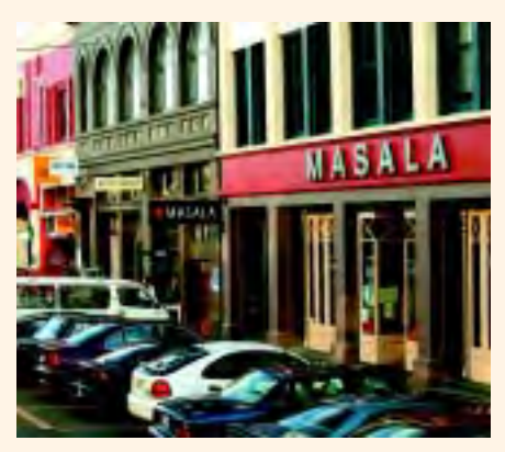
High quality public realm—Blair and Allen streets in Wellington were transformed from a redundant industrial and market area into an attractive area to work in, or walk through.

The only potential negative effect of improving the public realm is the social impact that occurs when people or businesses can no longer afford to remain in an area that has been redeveloped or 'gentrified'. However, studies suggest that – providing these possible social problems are also addressed – gentrification can be positive for a city and its residents.