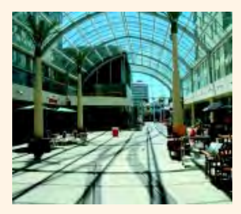
Connectivity – The Christchurch tram route runs through Cathedral Junction and is a popular tourist attraction.