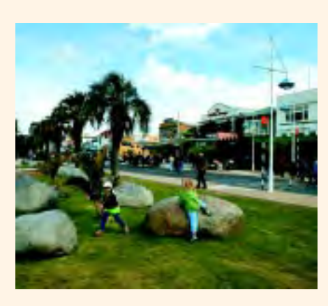
High quality public realm – The redevelopment of the Tauranga downtown waterfront created a key attraction and enhanced the economic vitality of the central city.