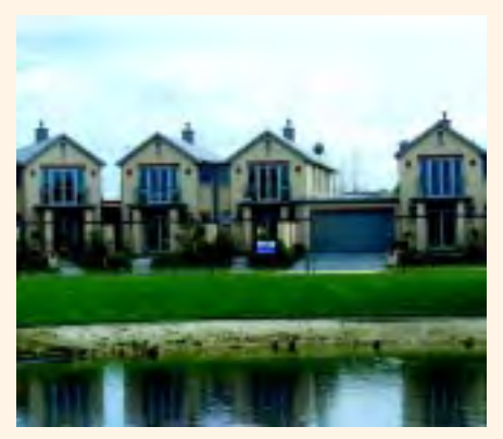
Density – Northwood residential area in Christchurch offers a choice of housing types, including medium density terraced housing.