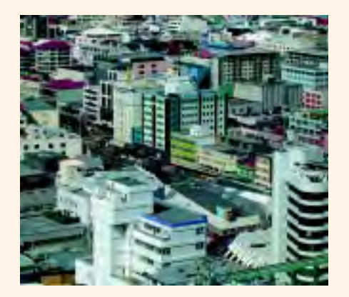
Density – Higher densities found in town or city centres like central Wellington provide exceptional access to office and retail employment.

Although there is strong evidence about some of the benefits inherent in high urban density, it is clear that density alone does not deliver benefits unless other important design issues are addressed too. Successful intensification and higher density in cities requires good design that also meets other needs – for instance, adequate open space and pedestrian friendly streets.