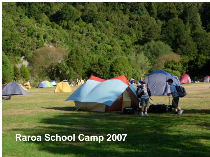
Raroa School Camp 2007

Summer has finally arrived and as a result the campground and swimming holes have been busy. Camping numbers for the 06-07 summer are now on a par with last years approximately 5,000 camper nights. Given the late start to summer this year, it is a pleasing result. One family from Upper Hutt has had their tent on site since Boxing Day! As a joke, the ranging team have installed a letter box outside their tent as they spend more time at Kaitoke than at home! With the children back at school, family camping is now more popular on the weekends. Several school groups have camped overnight and there have also been five tours/talks given to visiting schools on water infrastructure and forest ecology.