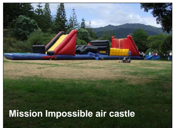
Mission Impossible air castle

Now that the rain has stopped we are seeing a dramatic increase in park users. Bookings that were cancelled earlier this summer are now being rescheduled for this period. The park has been a hive of activity with groups as large as 200 – 300 people enjoying their corporate or family picnics, with each one wanting to out-do the other in terms of activities. One group even had a ‘Mission Impossible’ air castle (pictured right) for them to enjoy on the day.