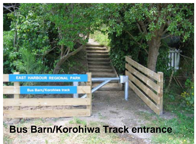
Bus Barn/Korohiwa Track entrance

There have been a number of events based at the park in recent weeks. Three summer programme events, including a fully booked Lower Gollans Valley off-track tramp and the ever popular Lighthouse and Lakes around Pencarrow Head, were enjoyed by all.