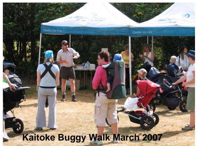
Kaitoke Buggy Walk March 2007

Apart from the Regional Outdoors Programme, other events of interest in the park have been a night tour (including feeding the resident eels), was given to 20 Kiwi Conservation Club members from the Forest and Bird Society. Also, a group of students from Upper Hutt College completed a revegetation project, clearing an area adjacent to the campground of blackberry and gorse and then planting several hundred native seedlings.