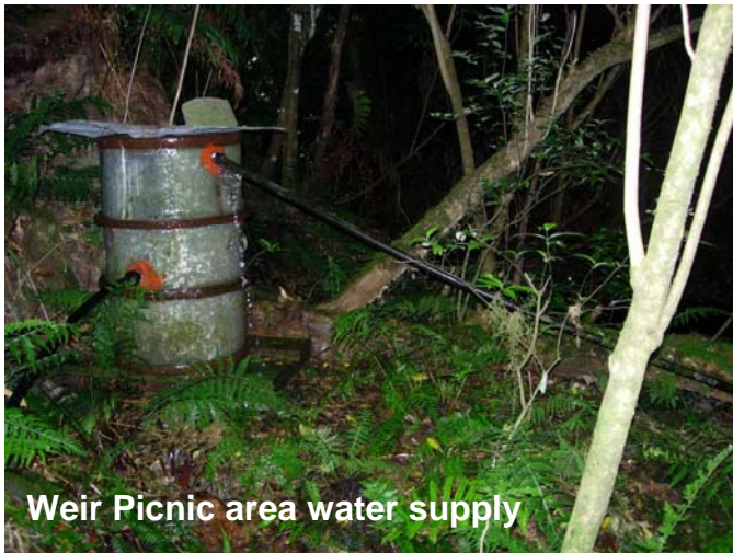
Weir Picnic area water supply

The Weir Picnic Area toilet water supply was fixed after it was damaged by vandals. This supply which is fed directly from Norbetts Creek is a great example of kiwi ingenuity and bush engineering and has provided a steady supply of water over many years. Siemens have repaired the power cabling under the Farm Creek ford that supplies the cell phone sites on the Hutt Water Collection Area access road.