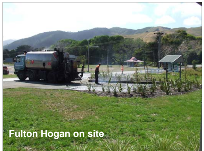
Fulton Hogan on site

Fulton Hogan was on site this period sealing the ranging office carpark as well as the ring road to the barn. The MacKays Crossing entrances are really starting to look nice and tidy. (pictured right).