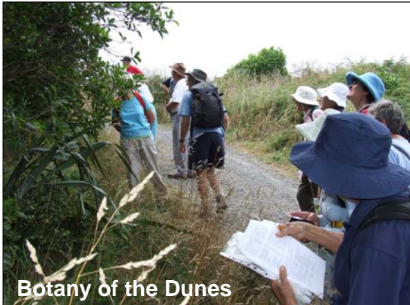
Botany of the Dunes

The ranger has continued to meet with a number of community groups interested in the park. With the holidays being over, there has been a renewed interest in public projects.