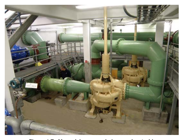
Figure 1 Te Marua lake pumps being used as turbines

Commissioning has been completed and final approval from the lines company is now required. The following two photographs show the two lake pumps being used as turbines (figure 1) and a screen shot of the control system software used to automate the generation process (figure 2).