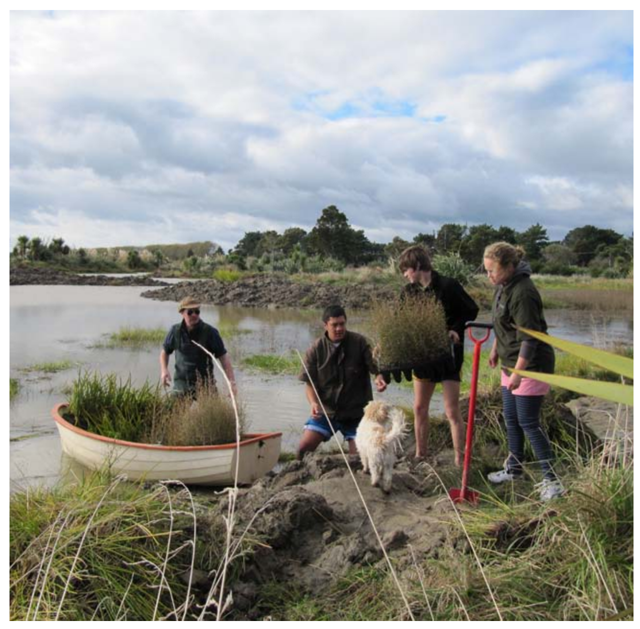
Ducks Unlimited members and volunteers planting at Wairio Wetlands