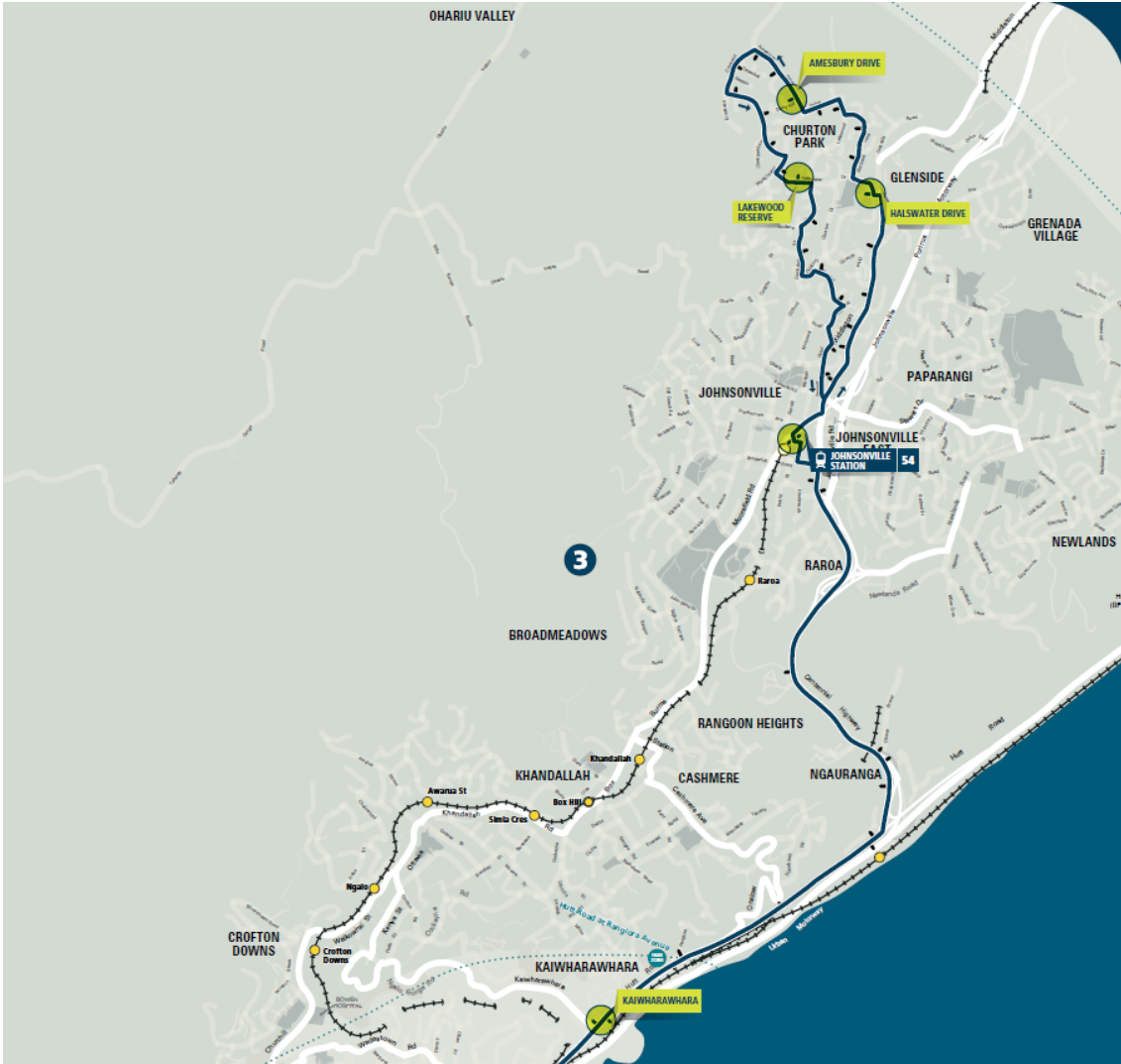
Churton Park bus route