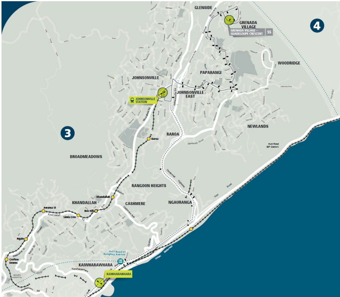
Grenada Village bus route