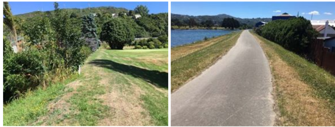
Right: Manor Park Golf Course Stopbank.

Figure 4 shows there are 11 stopbanks in moderate condition which relates mostly to minor vegetation growing on some stopbanks and one with some vehicle rutting on the stopbank crest. These issues are not urgent, as the risk of asset failure during a design flood event is very low.