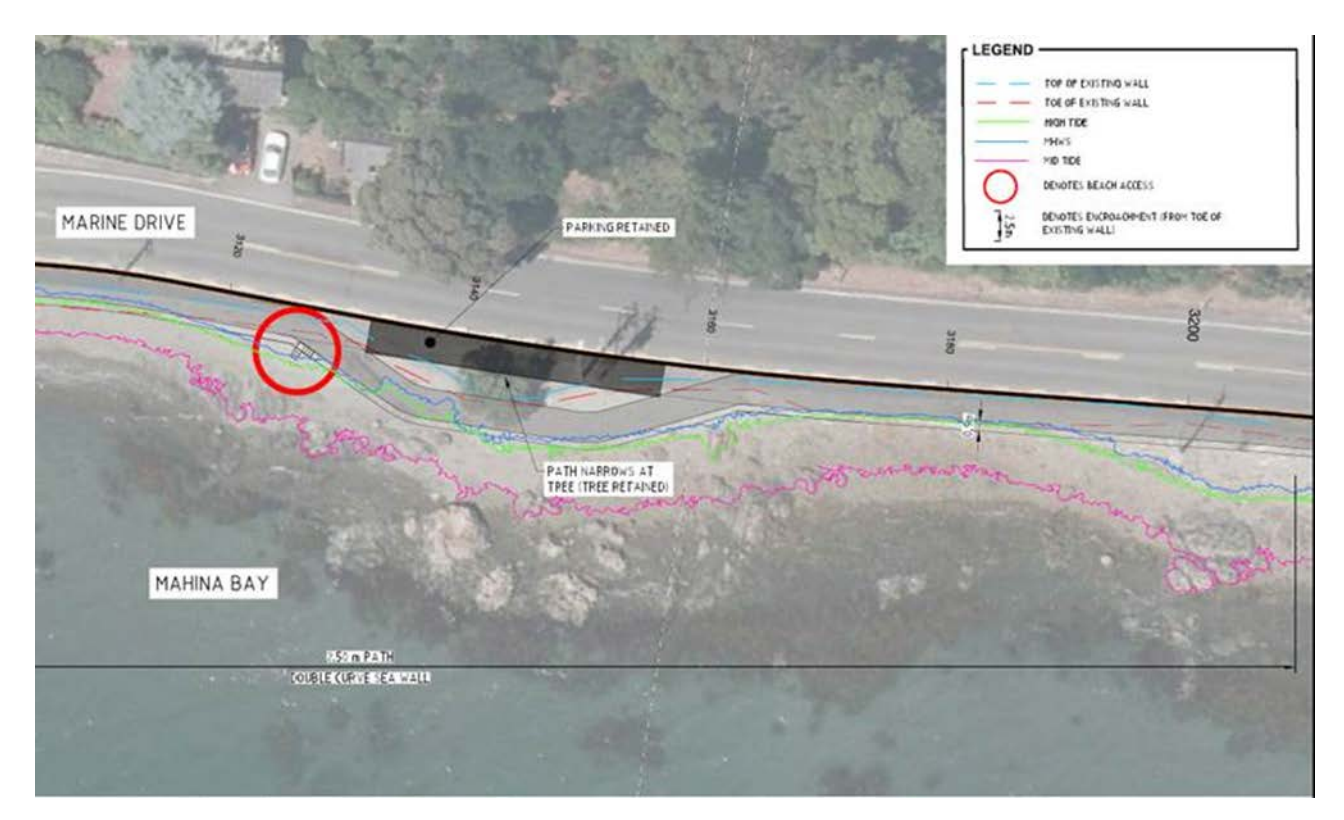
Figure 5-1: Plan of proposals on Thomas' land