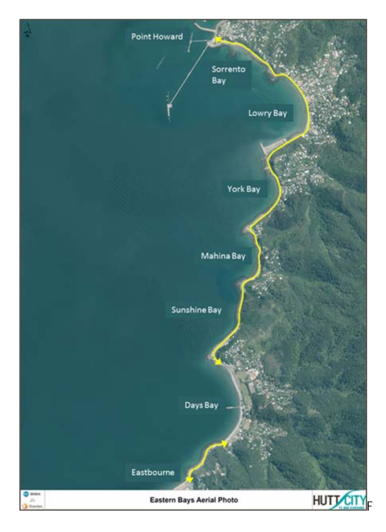
Figure 1-1: Map of the project area

Marine Drive is a coastal road that winds its way around headlands and bays between Point Howard and Eastbourne. The corridor provides few safe facilities for pedestrians and cyclists and for the most part are expected to use the narrow road shoulder or share the traffic lane. At a small number of locations, short sections of shared paths are available on the seaward side. These shared paths are predominantly located in areas where new seawalls have been constructed therefore allowing provision of this facility, or where considerable width already exists.