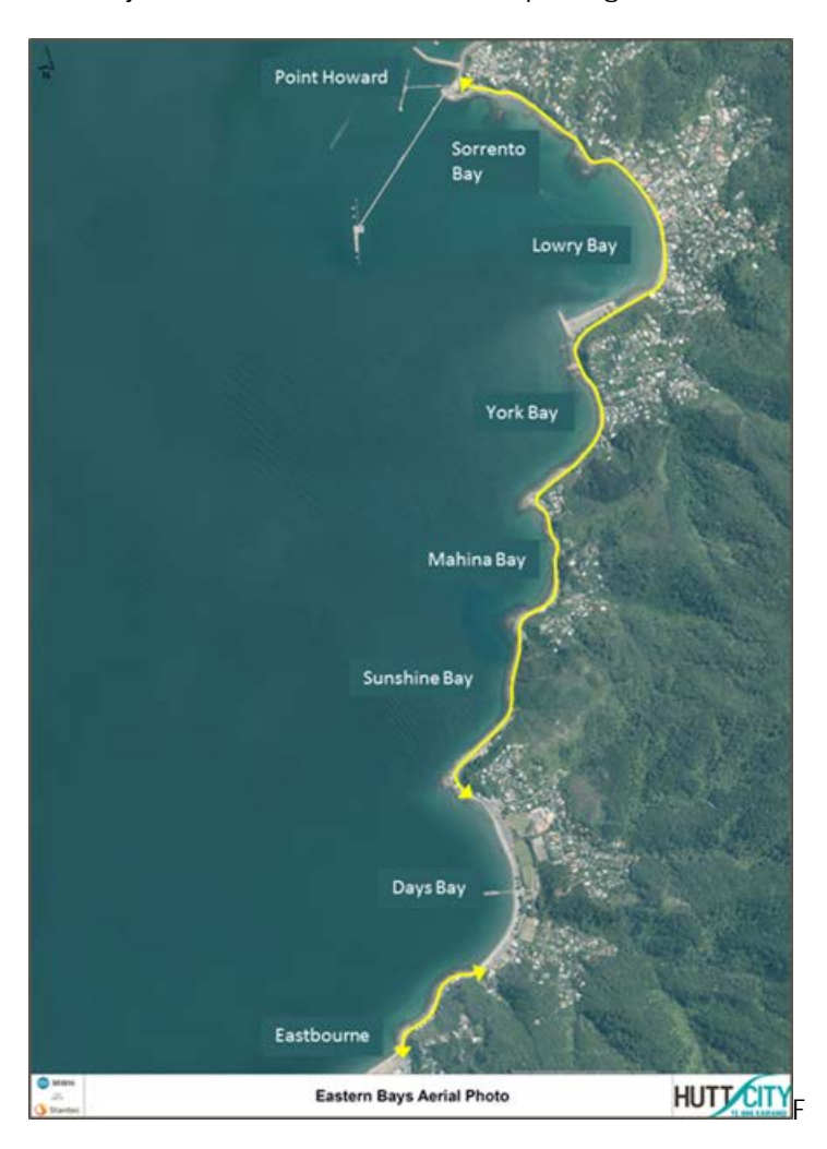
Figure 1-1: Map of the project area

The Project area is shown on the map in Figure 1-1