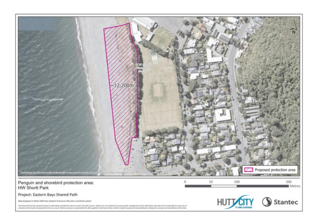
Fig. 5. West of HW Shortt Park penguin and shorebird protection area.