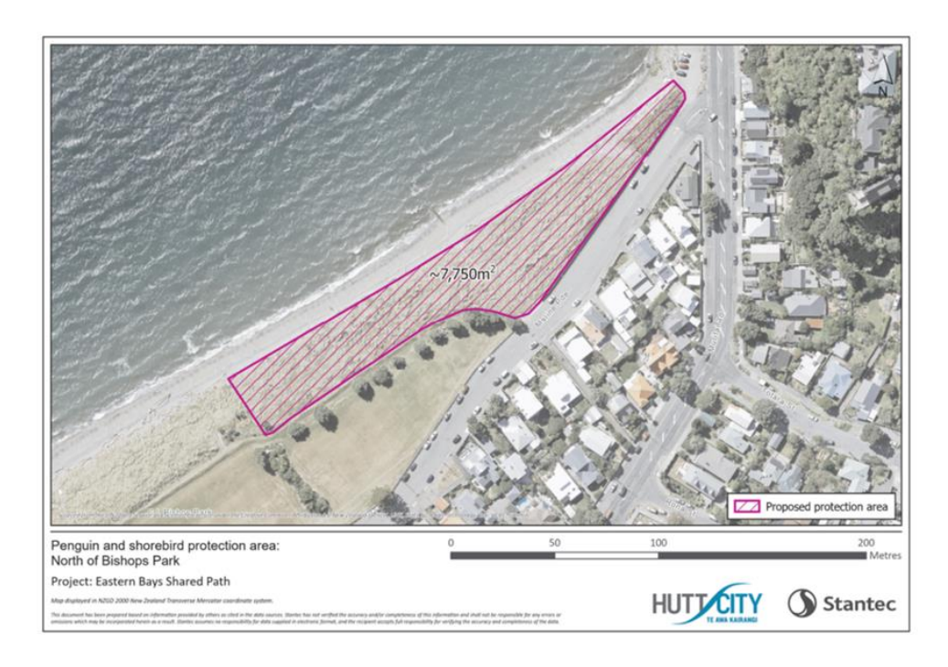
Figure 4: North of Bishops Park penguin and shorebird protection area.