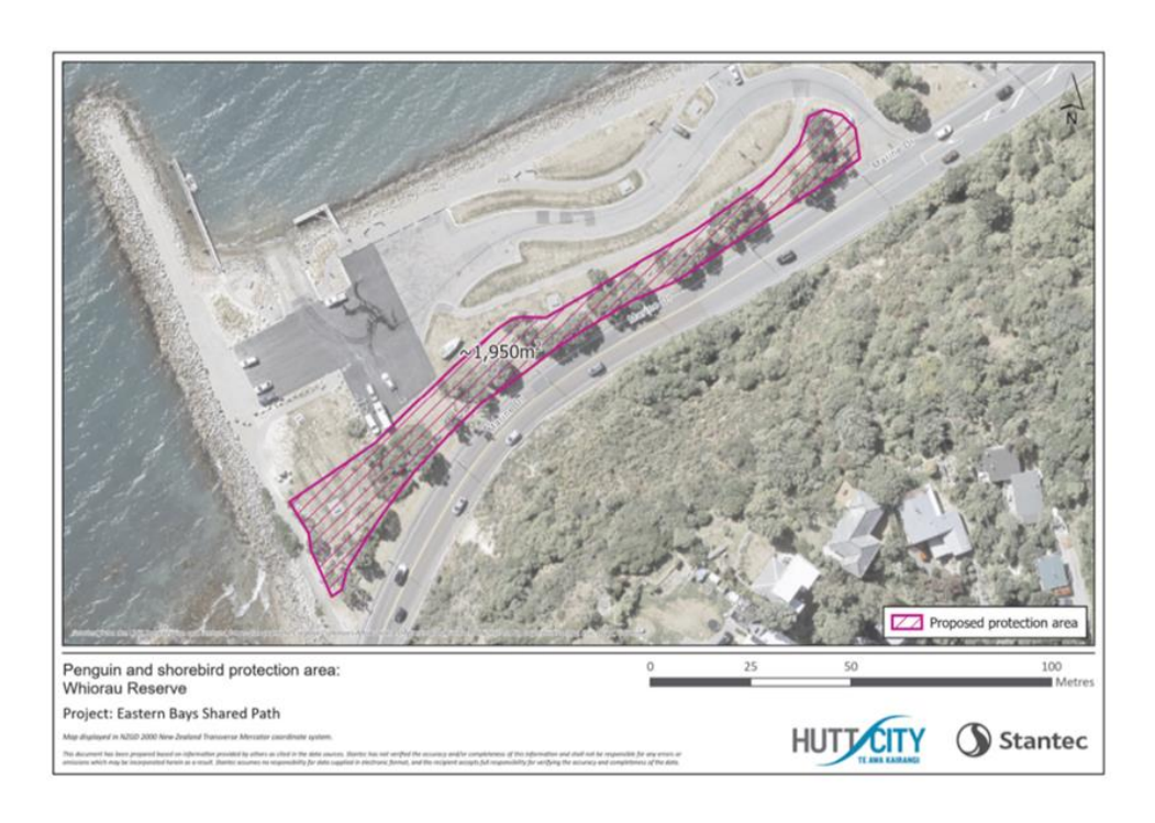
Figure 3: Whiorau Reserve kororā / little penguin protection area.