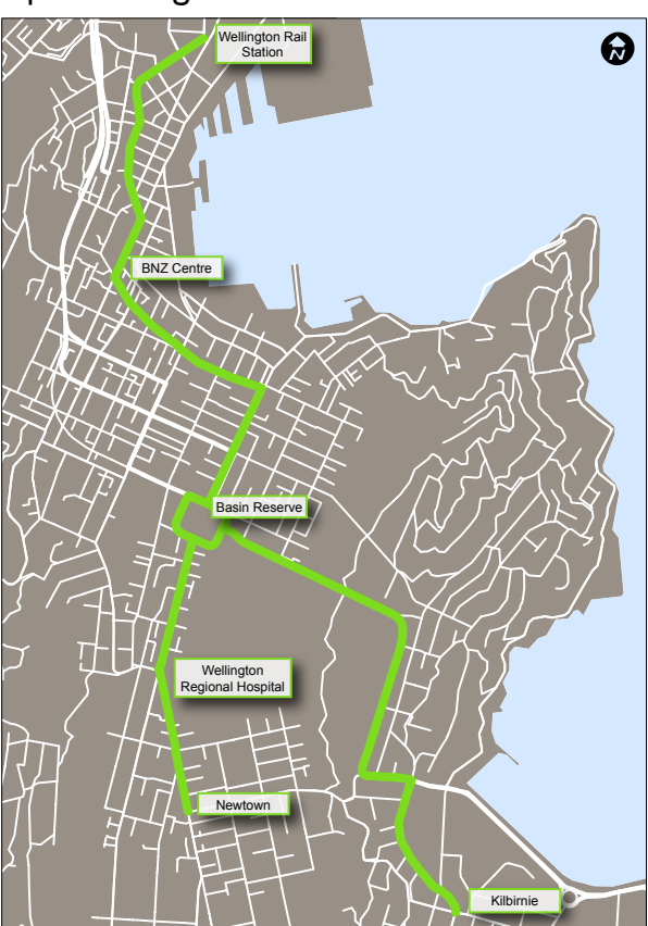
Option 3: Light Rail Transit

For those sections of the route where LRT lanes are proposed along the median (Kent/Cambridge Terraces, Adelaide Road and Riddiford Street), a