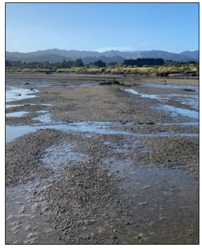
Ridges of gravel at Site B indicative of flood deposition.