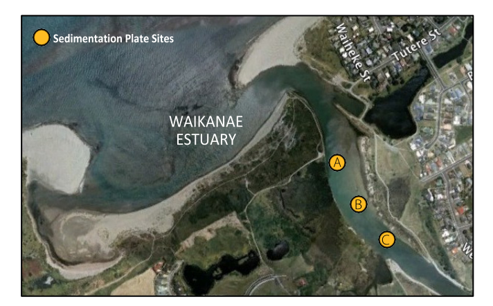
Fig. 1. Location of Waikanae Estuary monitoring sites.

Since 2010, Greater Wellington Regional Council has undertaken annual State of the Environment (SOE) monitoring in Waikanae Estuary to assess trends in the deposition rate, mud content, and oxygenation of intertidal sediments. Monitoring is conducted at three sites (A to C, Fig. 1) with the most recent results collected on 21 January 2022 summarised here.