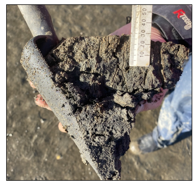
Example of well-oxygenated sediment at Site A.

Note: Grain size results are based on replicate composite samples (n=3) taken with the fine scale monitoring (2010-2012, 2017) or a single composite sample.