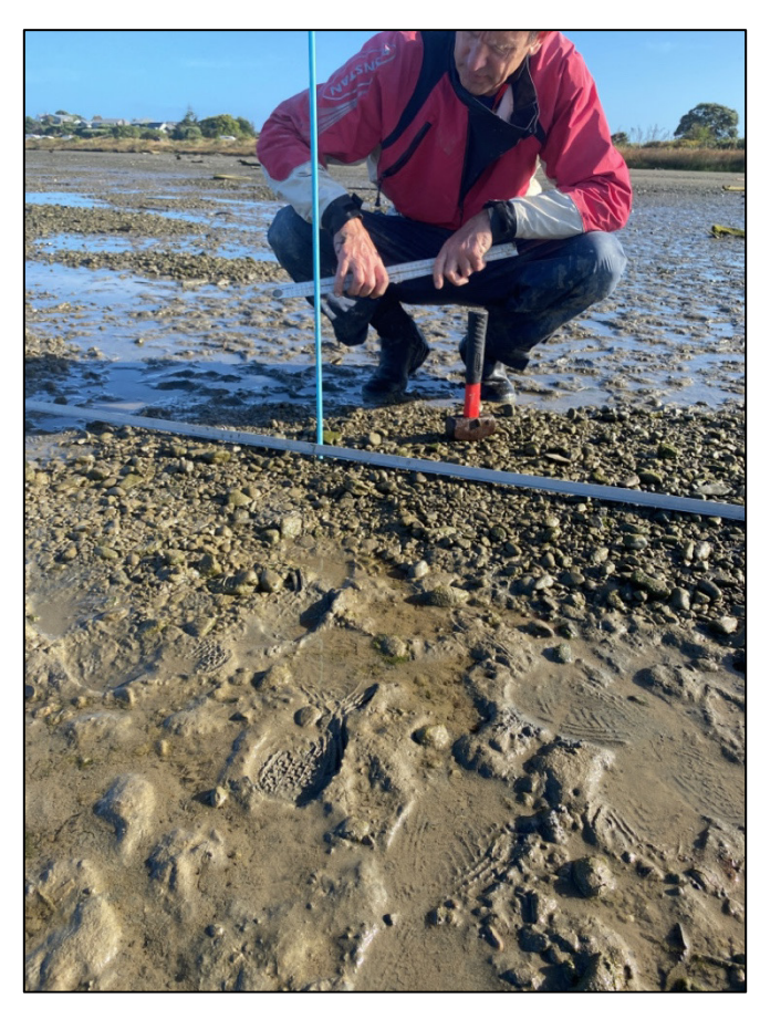
Mixed mud and gravel deposits at Site C.