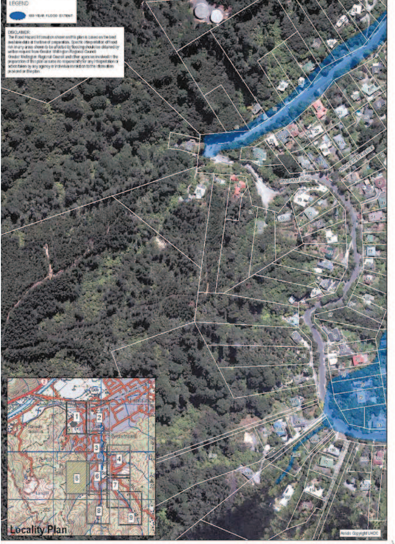
Figure 2 PINEHAVEN STREAM - Flood Hazard

Many areas in the Wellington Region are subject to flood risk. We advise that any known facts relating to the physical risk to a property should be disclosed to an insurer. This includes whether the property is exposed to any particular hazard by virtue of its location (e.g. flood). An insurer requires these facts when evaluating whether or not to underwrite the risk and, if so, on what terms.